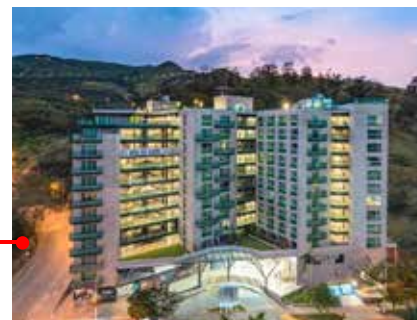
Hotel SPIRITO by SPIWAK - Cali www.spiwak.com/es/

Tarifas: Deluxe King COP $290.042 / por noche (No incluido impuesto IVA del 19%). USD $80/ per night