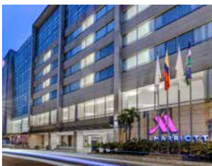
Hotel Marriott - Cali www.marriott.com/es/hotels/clomc-cali-marriott-hotel/overview/

Tarifas: Deluxe King COP $290.042 / por noche (No incluido impuesto IVA del 19%). USD $80/ per night