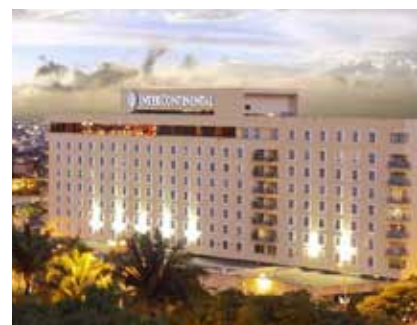
Hotel Estelar S.A. - Cali www.hotelesestelar.com/destinos-estelar/colombia/cali/intercontinental/

Tarifas: Deluxe Guest room, 1 King COP $682.000 /por noche (No incluido impuesto IVA del 19%). USD $186 / per night