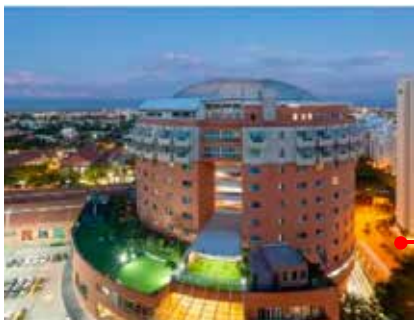
Hotel SPIWAK - Cali www.spiwak.com/es/

It is recommended to book your hotel months in advance, taking into account availability and occupancy due to the Petronio Álvarez cultural event, which is held in the city of Cali at the same time as the Assembly.